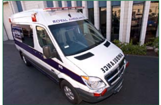
San Leandro based, Royal Ambulance has expanded its operations to serve Santa Clara County.

This move represents the next step in Royal's commitment to the geriatric community. Royal will be focusing on this population, serving skilled nursing facilities and acute care hospitals. Santa Clara's senior citizen community represents 10% of the population, according to the 2009 US Census numbers. Royal Ambulance currently services more than 100 medical facilities, and